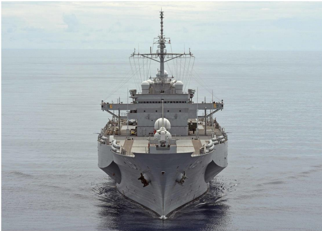
USS BLUE RIDGE (LCC 19)