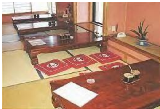
A restaurant with traditional low tables

In Japan, some restaurants and private houses are equipped with low Japanese style table and cushions on the floor.